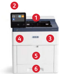
Xerox® VersaLink® C500 Color Printer Print.