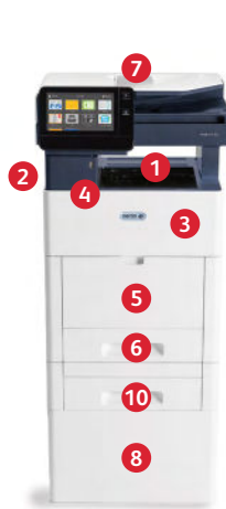
Xerox® VersaLink® C505 Color Multifunction Printer Print. Copy. Scan. Fax. Email.

1 500-sheet (C500) or 400-sheet (C505) output tray with tray-full sensor.