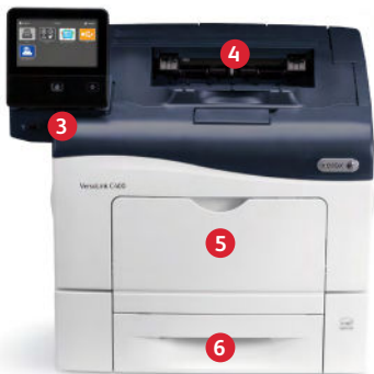
Xerox® VersaLink® C400 Color Printer Print.