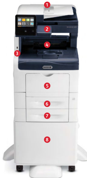
Xerox® VersaLink® C405 Color Multifunction Printer Print. Copy. Scan. Fax. Email.