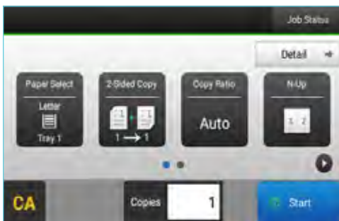
Easy Copy screen offers the most commonly used settings.