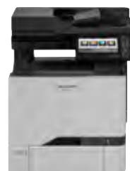
MXC407F shown in standard configuration

Embedded solutions let users load and run software solutions tailored to their specific need or industry. Properly configured, apps installed on the MFP can interact with users' unique processes, applications and data repositories , with custom icons to drive each process, if desired.