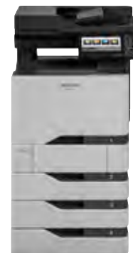
MXC507F shown with optional paper drawers