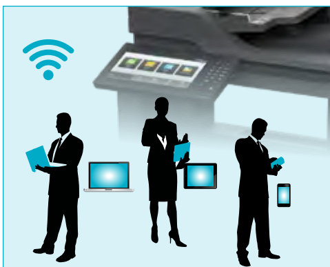
Optional wireless network interface for convenient scanning and printing from mobile devices.

From paper handling to networking, the MXC407F and MXC507F desktop colour document systems will exceed your expectations.