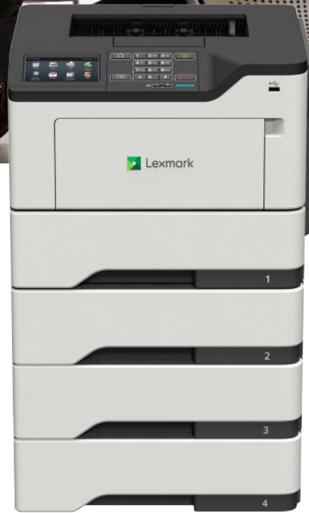
M3250 with optional trays