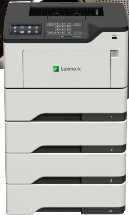
M3250 with optional trays